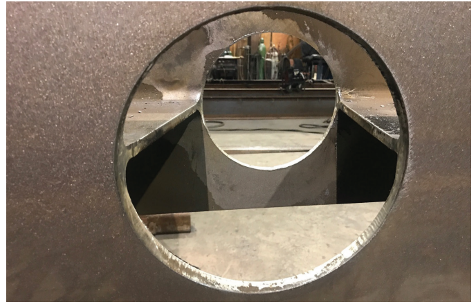
With SteelPRO and Güdel, one machine can make five or six holes in 15 minutes.

software — and other software improvements, Inovatech's Async control software program is 40 percent faster today than it was during its introduction just a few years ago. And while that's significant, the benefits of using an automated cutting table made of today's finest automation components translates to 400 percent more productivity for Inovatech's customers.